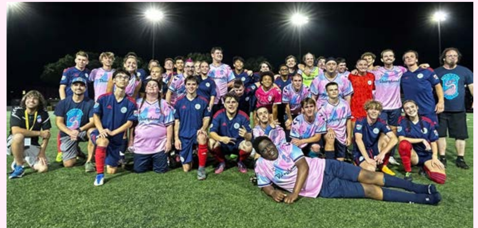
Unified Series match against Union Omaha at Breese Stevens Field