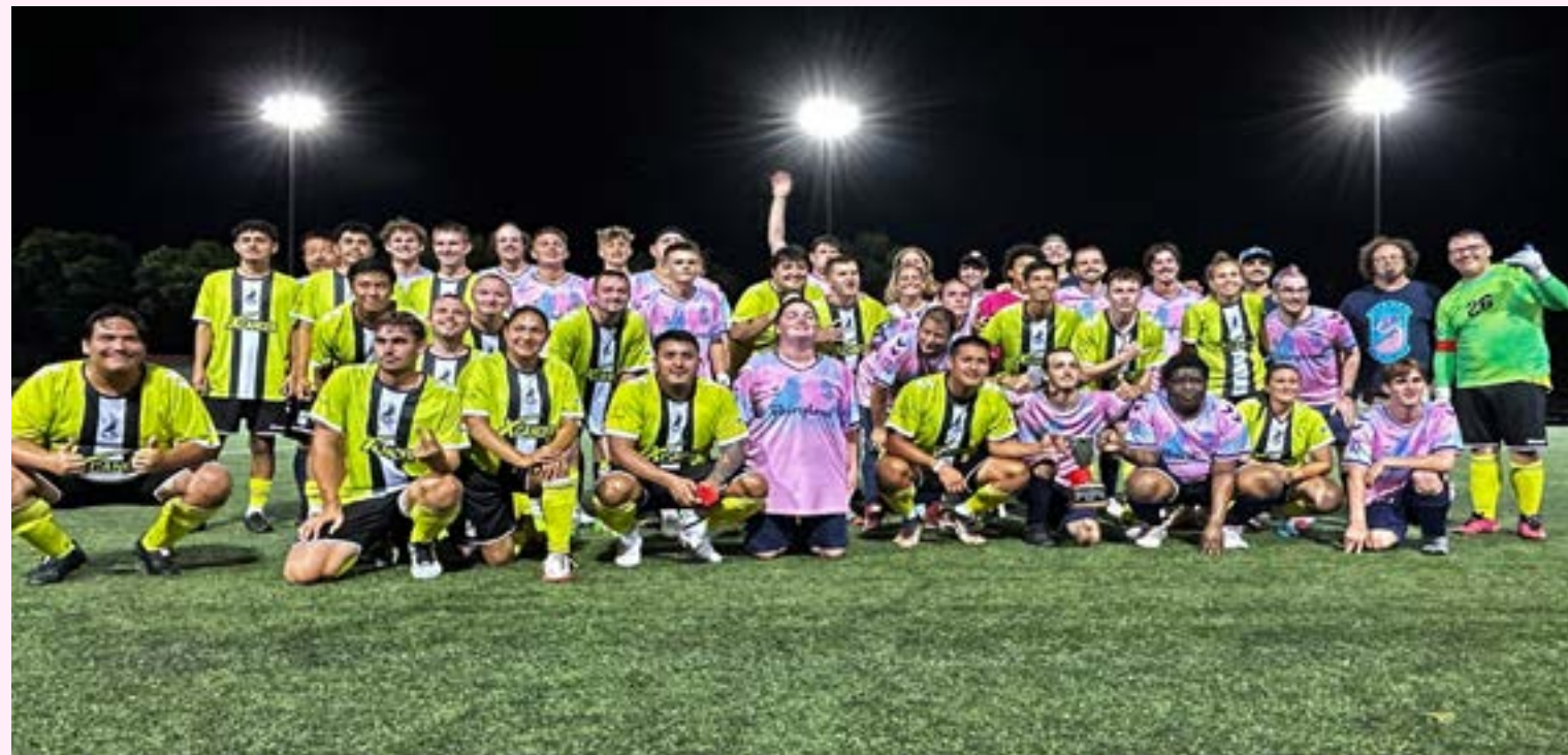
Unified Series match against Chicago Fire at Breese Stevens Field

The Special Olympics Unified Series presented by Exact Sciences returned in 2023. The Forward Madison FC Unified Team took on the Union Omaha Unified Team in a two legged cup, as well as the Chicago Fire FC Unified Team in a friendly at Breese Stevens Field. Forward Madison FC and Special Olympics Wisconsin hosted a joint press conference and signing day to welcome all of our 2023 Unified Athletes.